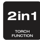
2 in 1 Torch function

Inspection light and Torchlight function