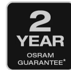
2 Year OSRAM Guarantee*

Inspection light and Torchlight function