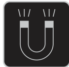
Magnet base & rotatable hook

Delivers up to 270 lumens of bright light for clear visibility in dark spaces