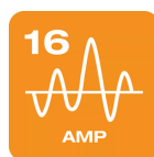
Connects to any 16A (3 phase) charging unit or station with a type 2 connection.

Charge at home and on the moveType 2 to Type27 PIN | 3PHASE