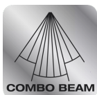
Combo Beam Combined beam of light