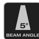
Beam angle 5° Exceptionally focused beam angle