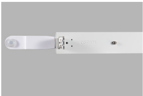
AirZing 5040 Product